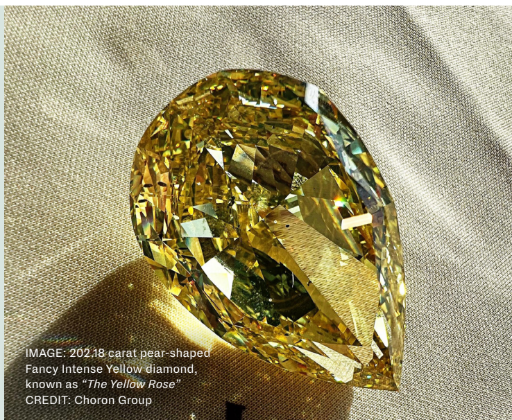
IMAGE: 202.18 carat pear-shaped Fancy Intense Yellow diamond, known as "The Yellow Rose"