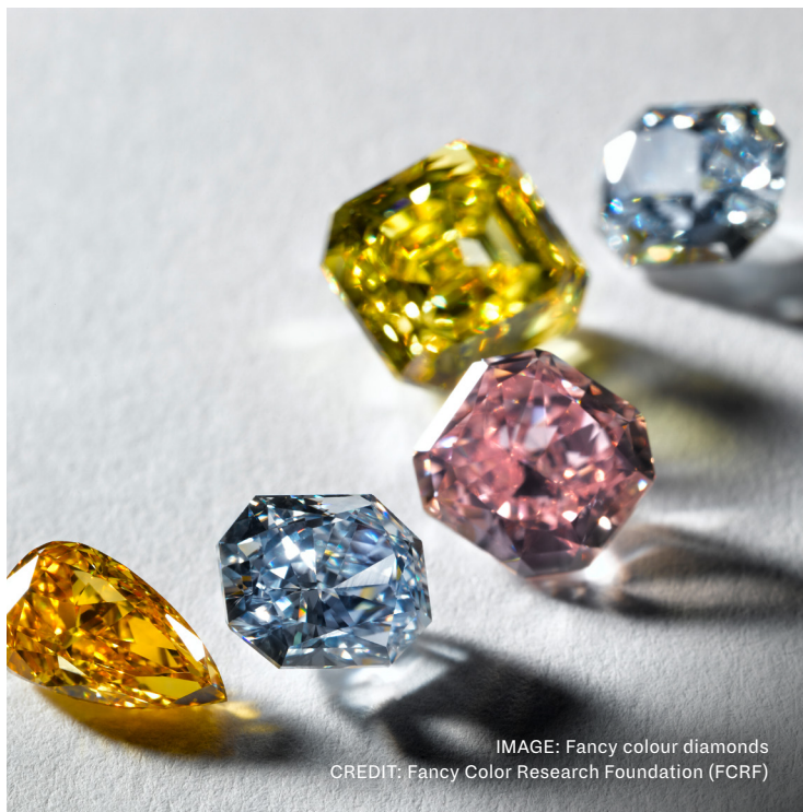
IMAGE: Fancy colour diamonds