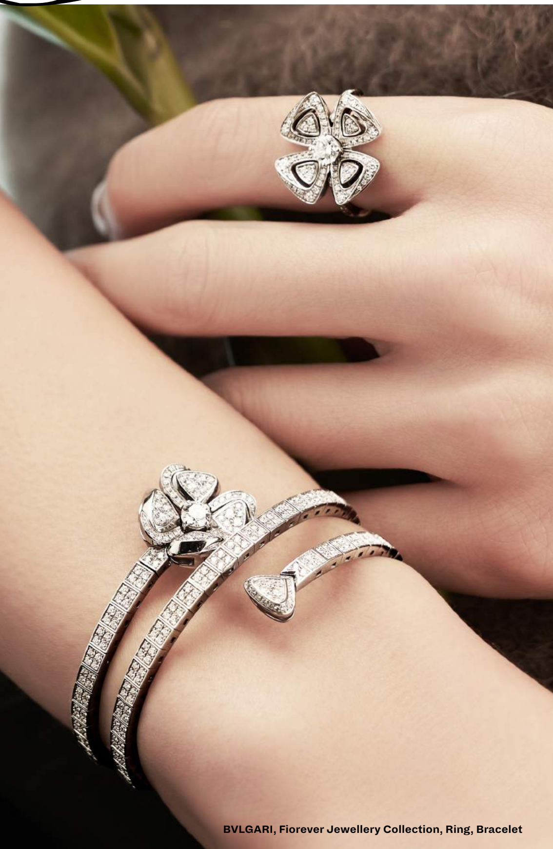
BVLGARI, Fiorever Jewellery Collection, Ring, Bracelet