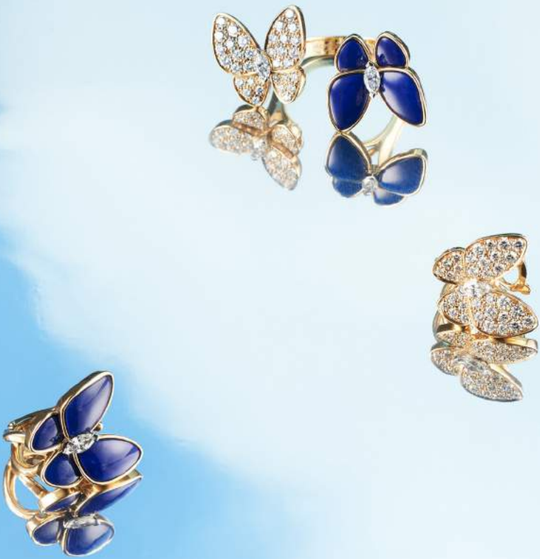
Van Cleef & Arpels, Two Butterfly, Between the Finger Ring, Earrings