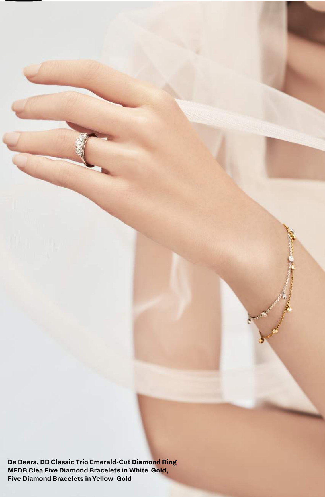
De Beers, DB Classic Trio Emerald-Cut Diamond Ring MFDB Clea Five Diamond Bracelets in White Gold, Five Diamond Bracelets in Yellow Gold