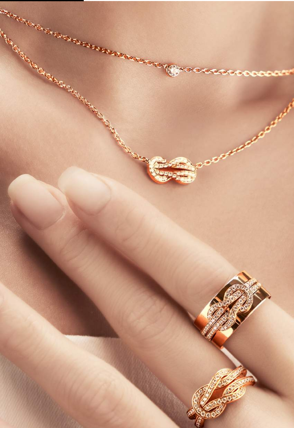
FRED, Chance Infinie Collection, 18k Pink Gold Necklace, 18k Pink Gold Ring