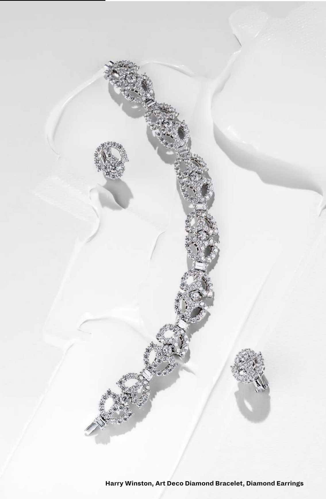
Harry Winston, Art Deco Diamond Bracelet, Diamond Earrings